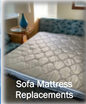
Sofa Mattress Replacements