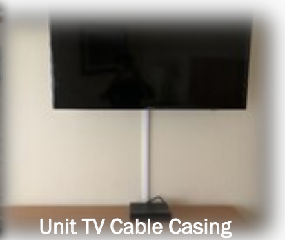
Unit TV Cable Casing